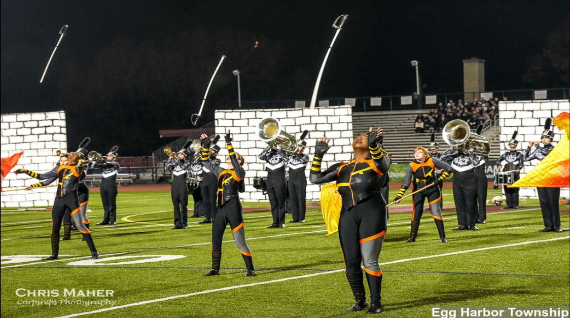
CHRIS MAHER Corpus Photography