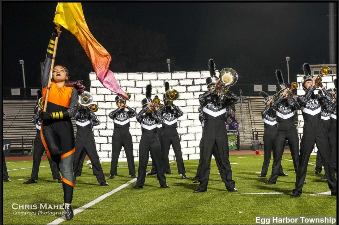
CHRIS MAHER Corpus Photography