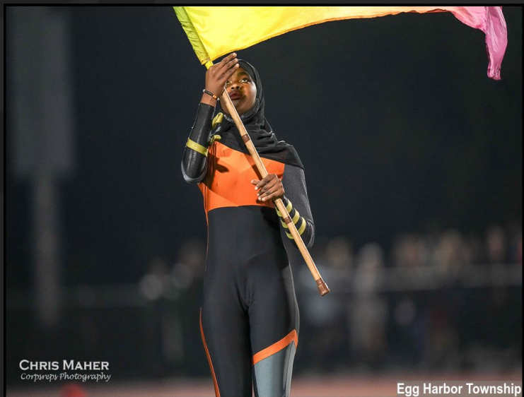
CHRIS MAHER Corpus Photography