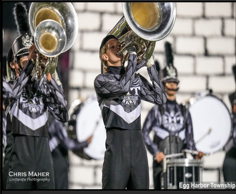
CHRIS MAHER Corpus Photography